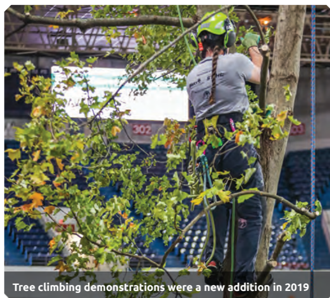
Tree climbing demonstrations were a new addition in 2019