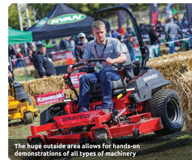
The huge outside area allows for hands-on demonstrations of all types of machinery