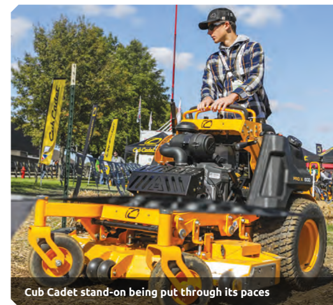
Cub Cadet stand-on being put through its paces