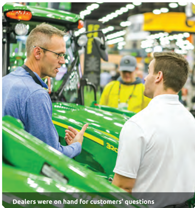
Dealers were on hand for customers' questions

The Dealer Technician Training content, meanwhile, offered a variety of hands-on training and certification sessions for technicians at basic and advanced levels. A variety of in-depth learning was available, with subjects such as Basics of Electronic Fuel Injection Systems , Two-Stroke Engine Failure Analysis and Hydraulic Troubleshooting among others being covered.