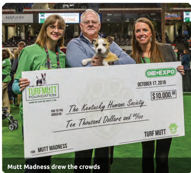
Mutt Madness drew the crowds

That doesn't just affect our industry; the auto industry, for example, is in apoplexy because of this situation between California and the federal government. It's extraordinarily challenging for them because you can sell cars across State lines. They are, therefore, asking themselves, what standards do we design to? What standards do we build to? In the auto industry they plan in seven- and 10-year production cycles – our industry plans in three- and five-year production cycles. And we follow them on power sources. Whatever's available for them to power the product, that's what we get down the line.