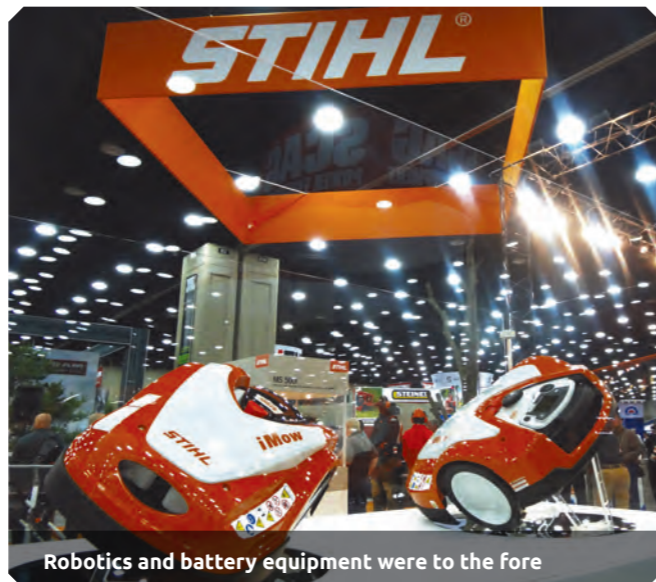
Robotics and battery equipment were to the fore