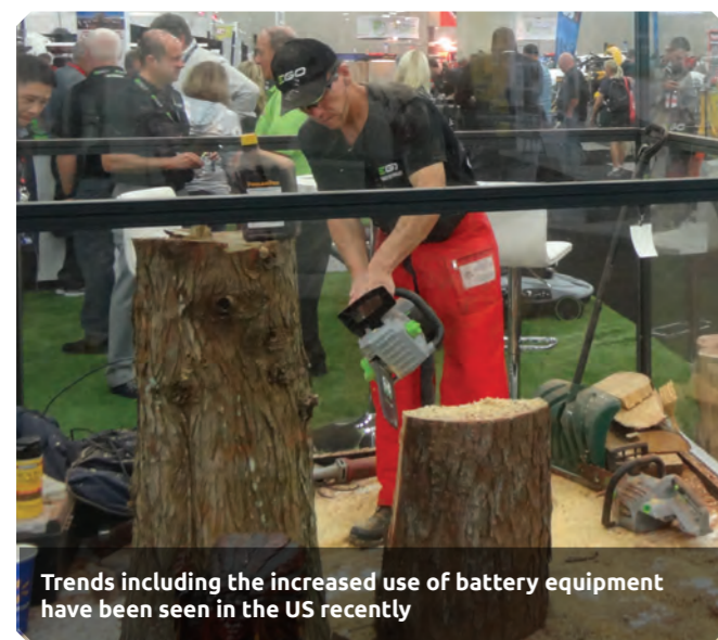
Trends including the increased use of battery equipment have been seen in the US recently