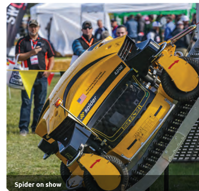
Spider on show