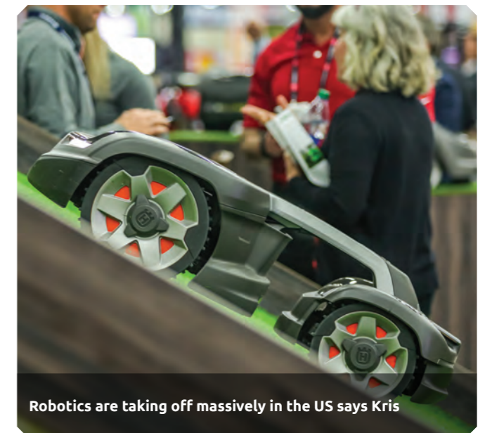
Robotics are taking off massively in the US says Kris