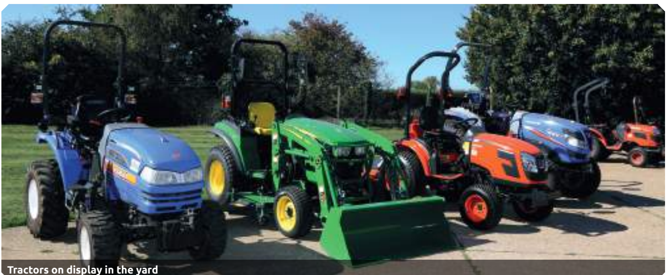
Tractors on display in the yard