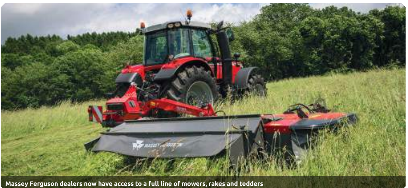
Massey Ferguson dealers now have access to a full line of mowers, rakes and tedders

Meanwhile, in addition to Lely-based balers and the former Fella mowers, rakes and tedders, only