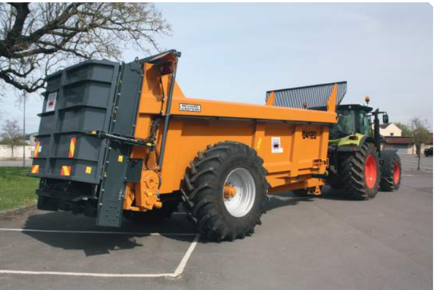
Muck spreaders, including high-capacity rear-discharge and tank-type machines, are the firm’s second main product group

“And our factory processes are constantly being upgraded and enhanced to ensure we produce our products to the highest possible standards, for the benefit of our customers and our dealers. We’re hoping to welcome as many as possible to our factory open days on 1st and 2nd November.”