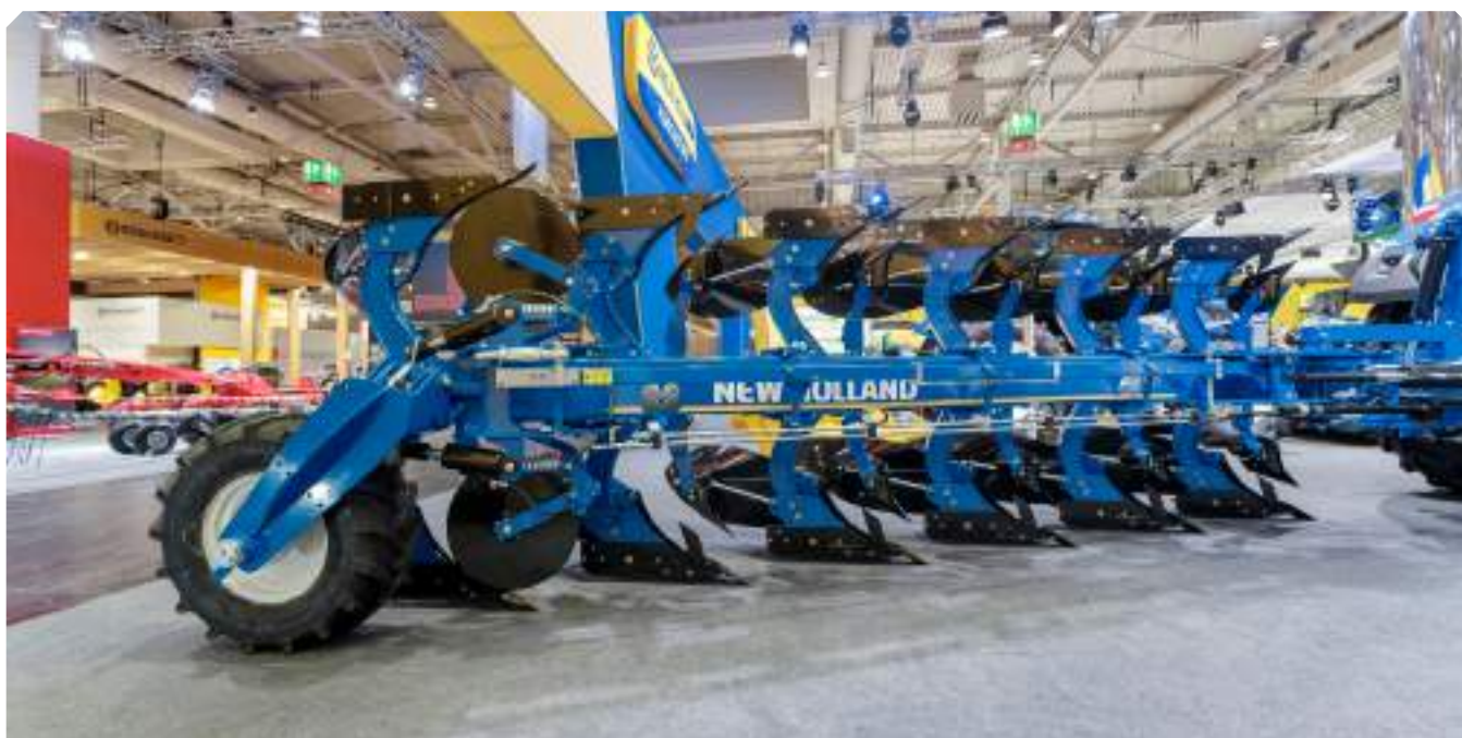
New Holland has added tillage and more forage implements to its line, including ploughs, since parent CNHi purchased Kongskilde's ag business

New Holland dealers also now have access to a wide range of materials handling and earthmoving