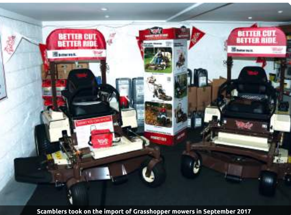
Scamblers took on the import of Grasshopper mowers in September 2017