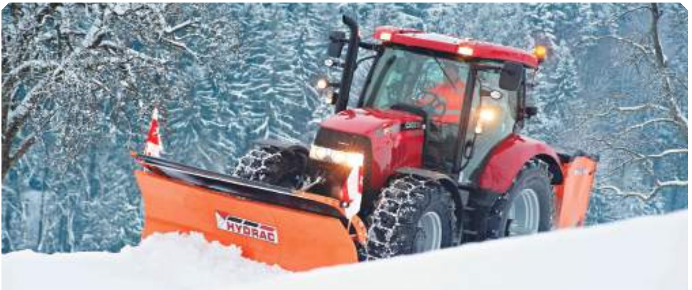
Case IH Maxxum