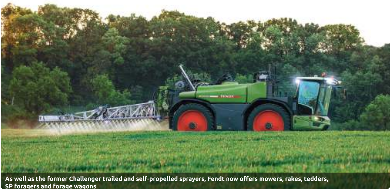
As well as the former Challenger trailed and self-propelled sprayers, Fendt now offers mowers, rakes, tedders, SP foragers and forage wagons

The Landini parent firm, which at the time also owned combine maker Laverda, created a long-line business when it first reintroduced the McCormick name to the UK, offering McCormick-branded combines and round and square balers alongside Doncaster-made tractors, and latterly developing its own reverse-drive telehandler. However, since choosing to relocate tractor manufacturing wholly to Italy, and disposing of its interest in Laverda to AGCO, it has focused on tractors alone, under both Landini and McCormick brands.