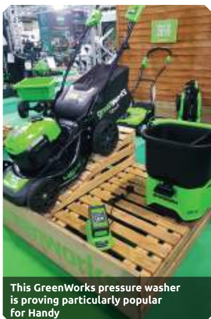
This GreenWorks pressure washer is proving particularly popular for Handy

A wander around the halls for a few hours could perhaps strike previously unconsidered inspiration!