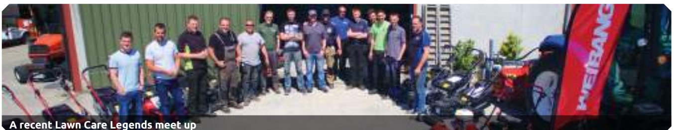
A recent Lawn Care Legends meet up

Lawn Care Legends LIVE will take place on 31st October at 2:00pm in concourse suites 22 and 23 by the SALTEX entrance.